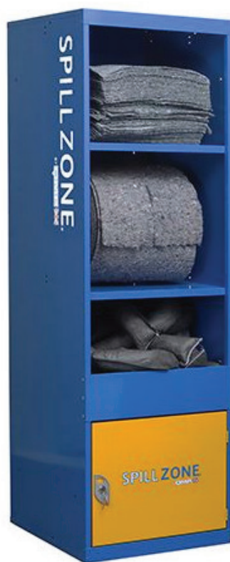
Lockable cupboard for absorbents