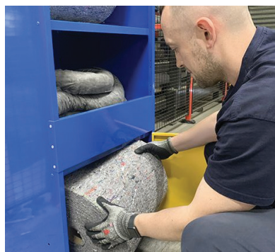
Bottom cupboard for replenishing stock